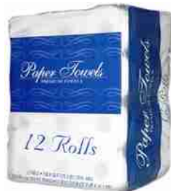
Hh-078 Paper Towel 12 Pack 11"t x 14" w x 18" d