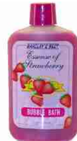
Hh-077 Bubble Bath 8.5"t x 4.25" w x 2.5" d