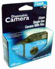
Hh-118 ND Camera 4.25" w x 5" t x 1.5" d