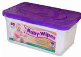
Hh-032 Baby Wipes 4"t x 9"w x 5"d