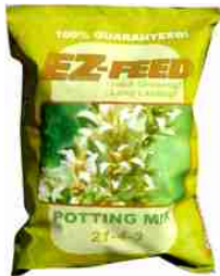
Hh-106 Potting Mix 27" x 20" w x 10d"