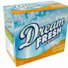
Hh-121 Dream Fresh Detergent 9" w x 8" t x 4.5" d