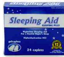
Hh-052 Sleeping Pills 3.5"t x 4"w x 1"d