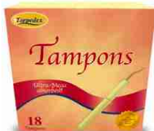
Hh-083 Tampons 5.5"t x 5.5" w x 3" d