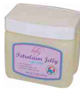
Hh-033 Petroleum Jelly 4"t x 4"w x 2.75"d