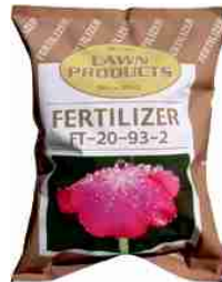
Hh-107 Fertilizer 27" x 20" w x 10d"