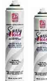
Hh-023 Hairspray 9.5"t x 2.5" w x 2.5"d 8.5"t x 2.5" w x 2.5"d