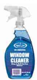
Hh-139 Window Cleaner 10.75" t x 4.5" w x 3" d