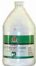
Hh-071 All Purpose Cleaner 12"t x 6" w x 6" d