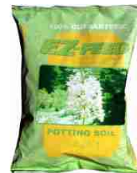
Hh-132 Potting Soil 27" t x 20" w x 10" d