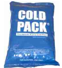
Hh-081 Instant Cold Packs 7.5"t x 5" w x 1.5" d