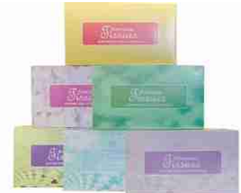
Hh-127 Standard Tissue Box 6" w x 11.5" t x 2" d