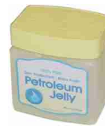
Hh-034 Petroleum Jelly 3.5"t x 3.5"w x 2.5"d