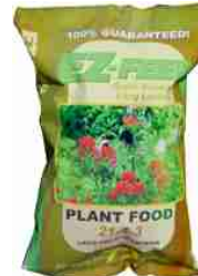
Hh-102 Plant Food 27" x 20" w x 10d"