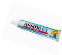
Hh-134 Annihilice 1.5" t x 5.5" w x 1" d