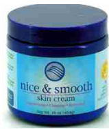
Hh-044 Skin Cream 3.5"t x 3.5"w x 3.5"d