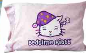
Hh-122 Bedtime Kitty Pillow 25" w x 16" t