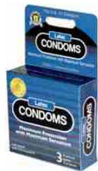
Hh-135 Condom 3-pack 4.25" t x 2.5" w x 1" d