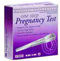
Hh-024 Pregnancy Test 4.5"t x 4.5" w x 1.5"d