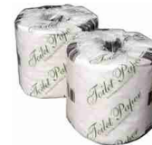
Hh-109 Toilet Paper Individual Rolls 4.5" x 5" w x 5d"