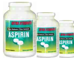
Hh-046 Aspirin 7"t x 4"w x 4"d 5.5"t x 3"w x 3"d 3.5"t x 2"w x 2"d