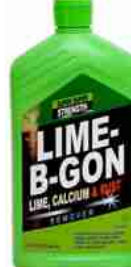
Hh-010 Lime-B-Gon 9.25"t x 4.5" w x 2.5"d