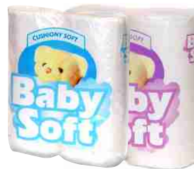
Hh-016 Toilet Paper 10"t x 8" w x 4"d