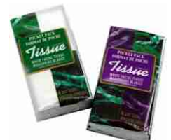
Hh-054 Tissue Packs 4.5"t x 2.5"w x 1"d