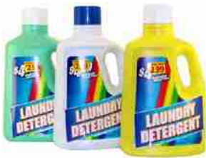
Hh-014 Laundry Detergent 13.5"t x 8" w x 5.5"d