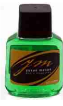
Hh-028 YM Men's Cologne 4.5"t x 3" w x 1.5"d