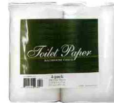
Hh-110 Toilet Paper 4 Pack 9" x 10" w x 5d"