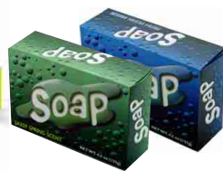
Hh-050 Soap 2.75"t x 4"w x 1.5"d