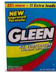
Hh-092 Gleen Detergent 13.5" x 9.5" w x 4.5"