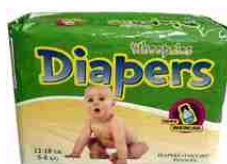
Hh-057 Whoopies 8.5"t x 12"w x 4.5"d 12"t x 16"w x 5"d 14"t x 20"w x 10"d