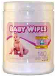
Hh-031 Baby Wipes 5" Dia. x 7" T