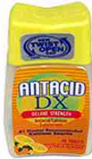
Hh-003 Antacid Tablets 4.25"t x 2.5" w x 1.5"d