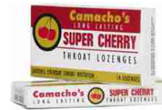
Hh-041 Throat Lozenges 2"t x 4"w x 7.5"d