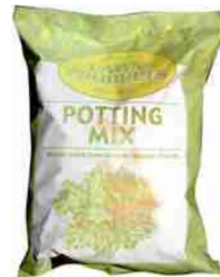
Hh-131 Potting Mix 27" t x 20" w x 10" h