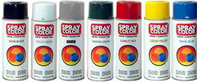
Hh-063 Spray Paint-Assorted Colors 8"t x 2.75" w x 2.75" d