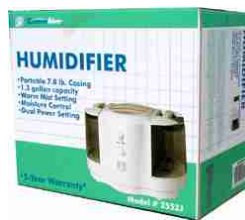
Hh-101 Humidifier Elec-032 17" x 22" w x 12"