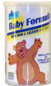
Hh-039 Baby Formula 7"t x 7"w x 7"d Green/Yellow Cans Also Available