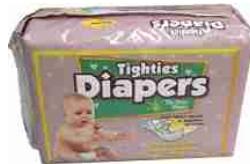
Hh-056 Tighties Diapers-3 Sizes 8.5"t x 12"w x 4.5"d 12"t x 16"w x 5"d 14"t x 20"w x 10"d