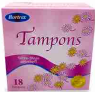
Hh-112 Tampon Box 5.5" x 5.5" w x 3" d