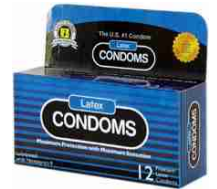
Hh-133 Condom Box 4" t x 5" w x 1.5" d