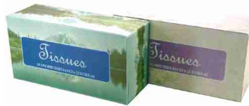
Hh-126 Large Tissue Box 9.5" w x 5" t x 3.5" h