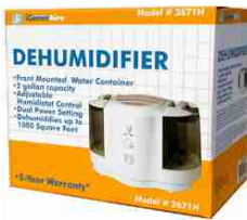
Hh-100 Dehumidifier Elec-031 17" x 22" w x 12"