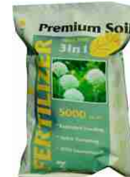
Hh-104 Premium Soil 27" x 20" w x 10d"