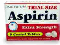
Hh-053 Aspirin 2.5"t x 3"w x 1"d