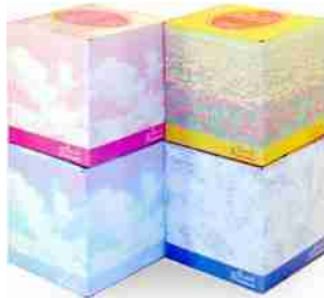
Hh-125 Square Tissue Box 4.5" w x 4.5" t x 5" h