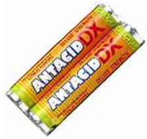
Hh-001 Antacid Rolls .75" Dia. x 3.25"L