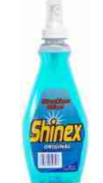
Hh-012 Shinex 9.5"t x 3.5" w x 1.75"d