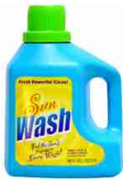
Hh-013 Laundry Detergent 10.5"t x 7" w x 5.5"d