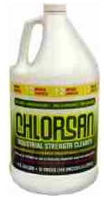
Hh-006 Chlorox 10"t x 6" w x 6"d