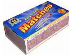
Hh-130 Match Box 4.75" t x 1.5" w x 2.5" h