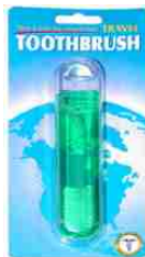
Hh-055 Travel Toothbrush 6.25"t x 3"w x .75"d