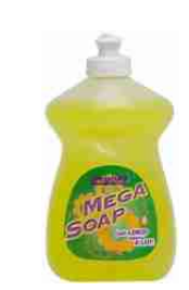
Hh-011 Mega Soap Dish Soap 9"t x 4.5" w x 3"d