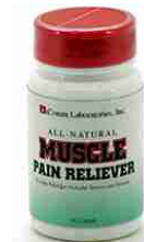
Hh-059 Pain Reliever 3.5"t x 1.5"w x 1.5"d