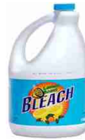
Hh-005 Bleach 10"t x 6" w x 6"d