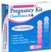
Hh-025 Pregnancy Test 4.5"t x 4.5" w x 1.5"d