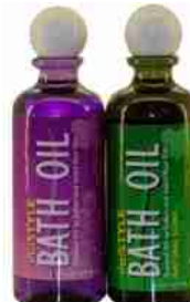
Hh-075 Bath Oil 8.75"t x 2.75" w x 2.75" d