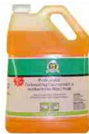
Hh-067 Anit-Bacterial Soap 11.5"t x 7.5" w x 4" d