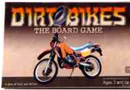
Hh-095 Board Game- Dirt Bikes 10.5" x 16" w x 1.5"