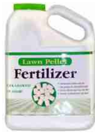
Hh-090 Lawn Pellet Fertilizer 10" x 7" w x 5"