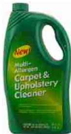
Hh-066 Carpet Cleaner 10.5"t x 5.5" w x 2.25" d