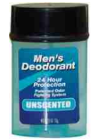
Hh-099 Men's Deodorant 4.5" x 2.5" w x 1.5"