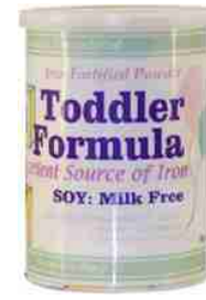
Hh-035 Toddler Formula 6"t x 4"w x 4"d