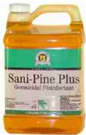
Hh-065 Sani-Pine Plus 11.5"t x 7.5" w x 4" d