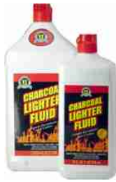
Hh-129 Lighter Fluid 11" x 5" x 3" 9.5" x 3.5" x 2.5"