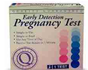
Hh-117 Pregnancy Test 4.25" x 4.25" w x 1.5" d