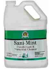
Hh-064 Sani-Mint Cleaner 11.5"t x 7.5" w x 4" d