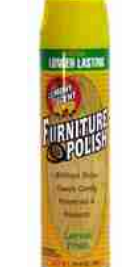
Hh-009 Dish Clean Dish Soap 9"t x 2.5" w x 2.5"d