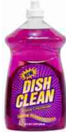
Hh-008 Dish Clean Dish Soap 9"t x 4.5" w x 3"d