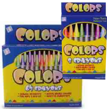
Hh-094 Crayon 8 Pack or 64 Pack 4.75" x 2.75" w x 5"