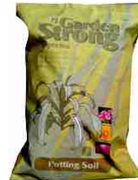
Hh-108 Potting Soil 27" x 20" w x 10d"