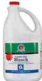
Hh-073 Germicidal Bleach 12"t x 6" w x 6" d