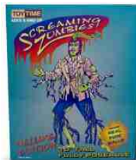
Hh-113 Screaming Zombies Toy Box 14" x 11" w x 3" d