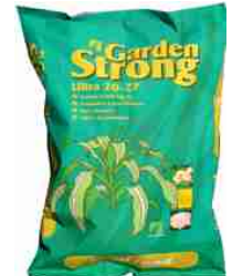
Hh-105 Plant Food 27" x 20" w x 10d"