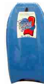
Hh-116 Foam Wave Board 41" x 20" w x 3" d