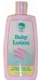
Hh-040 Baby Lotion 7.5"t x 3.5"w x 1.75"d