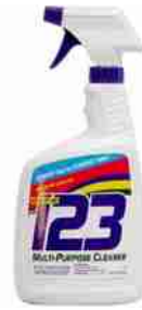
Hh-004 123 Cleaner 11"t x 5" w x 2.75"d