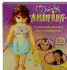
Hh-114 Dancing Shirley Toy Box 16" x 15" w x 5" d