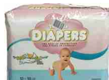
Hh-058 Lil Thunder 8.5"t x 12"w x 4.5"d 12"t x 16"w x 5"d 14"t x 20"w x 10"d