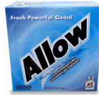
Hh-091 Allow Detergent 10.5" x 8.75" w x 5"