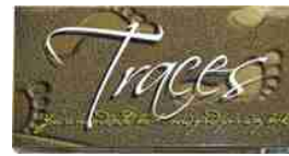
Hh-097 Board Game- Traces 8" x 16" w x 1.5"