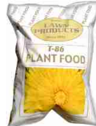
Hh-103 Plant Food 27" x 20" w x 10d"