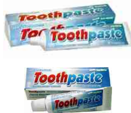
Hh-045 Toothpaste 2"t x 8.5"w x 1.5"d 1"t x 4.5"w x 1"d