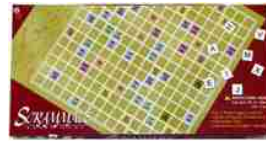
Hh-096 Board Game- Scrammage 8" x 16" w x 1.5"