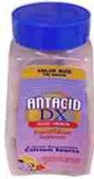
Hh-002 Antacid Tablets 5.75"t x 3" w x 2.75"d