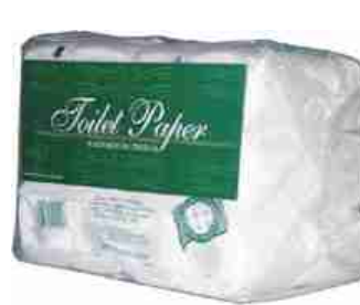
Hh-079 Toilet Paper 24 Pack 9"t x 14.5" w x 11.5" d