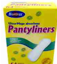
Hh-084 Panty Liners 6"t x 4.5" w x 3" d