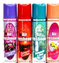
Hh-015 Air Freshener 9"t x 2.5" w x 2.5"d