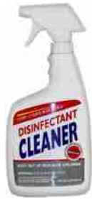
Hh-089 Disinfectant Cleaner 10.5" x 4.75" w x 2.5"