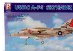
Hh-115 Skyhawk Model 9" x 13" w x 3" d