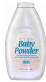
Hh-030 Pure Baby Powder 8"t x 4.5" w x 2.5"d