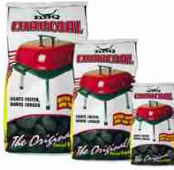
Hh-120 Charcoal Bags 17" t x 8" w x 4" d