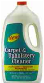
Hh-072 Carpet/Upholstery Cleaner 12"t x 6" w x 3.75" d