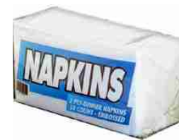
Hh-080 Napkins 4"t x 7.75" w x 3.5" d