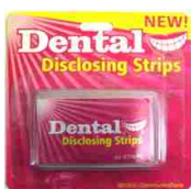
Hh-082 Disclosing Strips 3"t x 3" w x 5" d