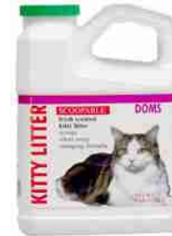
Hh-017 Kitty Litter 10"t x 7" w x 5"d