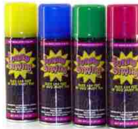
Hh-074 Funny String 6"t x 1.75" w x 1.75" d