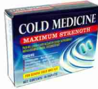
Hh-119 Cold Medicine 3" t x 4" w x 1" d