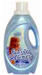
Hh-123 Fabric Softener 12" t x 6.5" w x 3.5" d