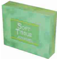
Hh-124 Small Tissue Box 4.75" w x 5.75" t x 1.5" h