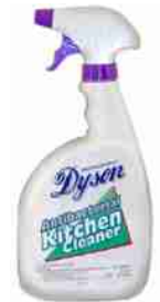
Hh-070 Dyson Kitchen Cleaner 11"t x 5" w x 3.5" d